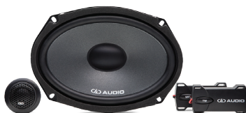
DC6X9a 6x9" Component Set

50w-125w Mounting Diameter - 6x9" Mounting Depth - 2.4"