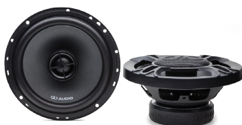
DX6.5a 6.5" Coaxial

50w-150w Mounting Diameter - 5.6" Mounting Depth - 2.4"