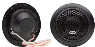
T2b 25mm Cloth Dome Tweeter

The D Series components and coaxials are high tech, high fidelity speakers designed for the listener wanting to go well beyond the standard factory upgrade.