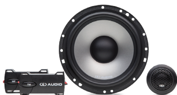
DC6.5a 6.5" Component Set

50w-150w Mounting Diameter - 5.6" Mounting Depth - 2.4"