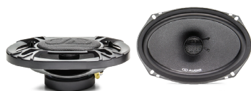
DX6X9a 6x9" Coaxial

50w-150w Mounting Diameter - 6x9" Mounting Depth - 2.4"