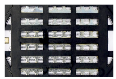
PLANAR MAGNETIC DRIVER TECHNOLOGY