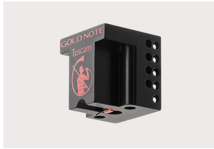
TUSCANY RED MC Low Output Phono Cartridge