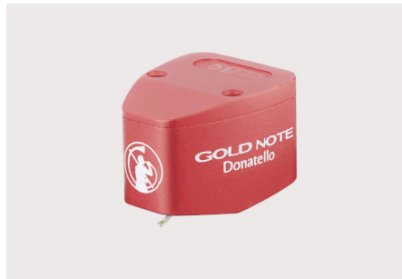
DONATELLO RED MC High Output Phono Cartridge