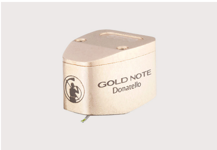
DONATELLO GOLD MC Low Output Phono Cartridge