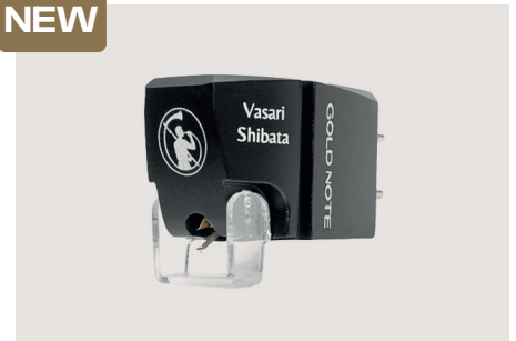
VASARI SHIBATA MM Phono Cartridge