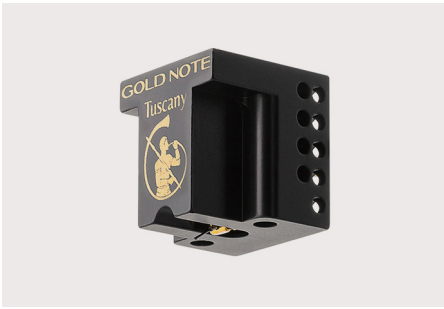
TUSCANY GOLD MC Low Output Phono Cartridge